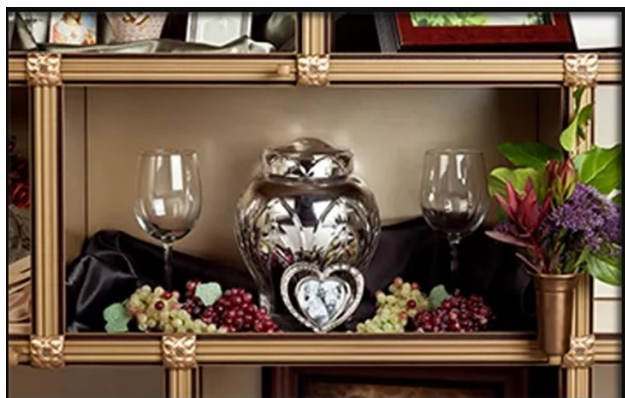
Example of a Glass-Front Niche

News from Memorial Properties continues to be good. Year to Year sales grew during 2020, and several areas are trending to include glass fronted cremation niches in Huntington Chapel, pre-sale crypts in the New Garden addition, monuments, and reclaimed lots in the historical sections of the cemetery.