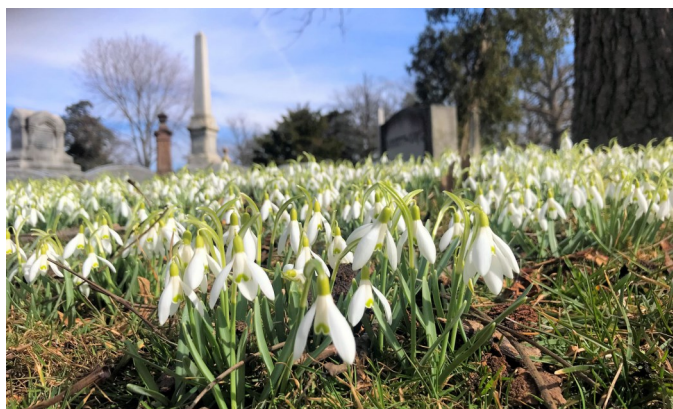
Snow drops blooming in section A - traditionally a sign of hope as one of the first blooms of spring.