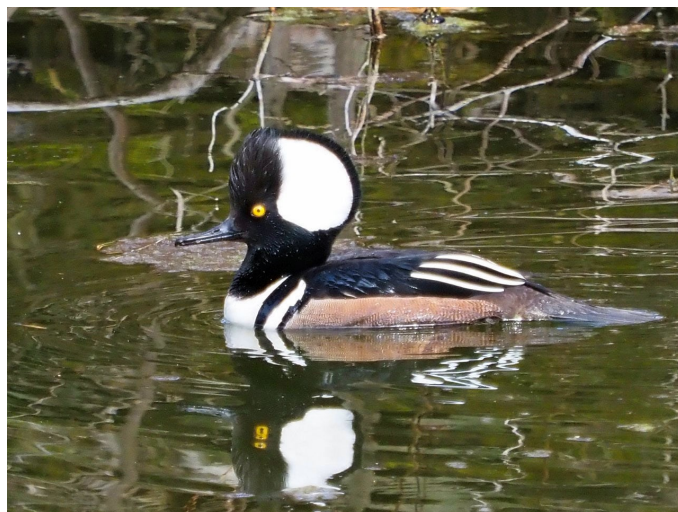
A hooded merganser at the pond