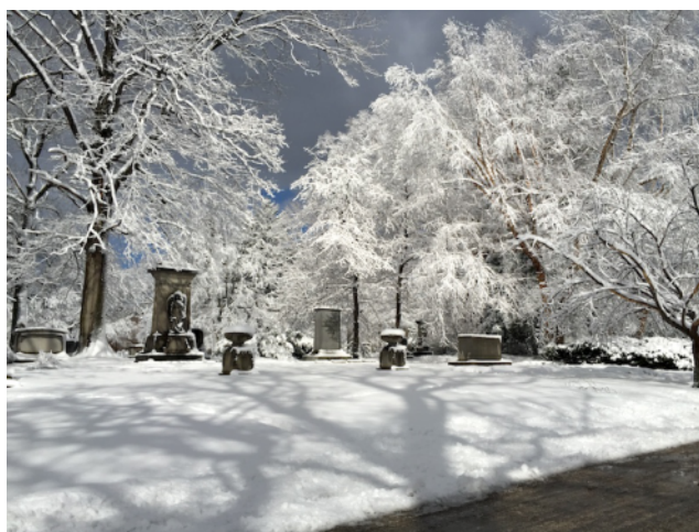
Lakeview Cemetery - Cleveland

The Davey Tree Expert Company 11722 Call Drive Concord, OH 44077 PH: 330-612-8631 ed.gallagher@davey.com