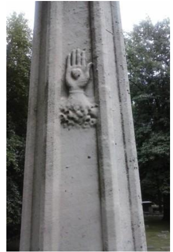
The hand that holds the heart gives of himself.

Your gift is a tax deductible donation to a 501(c)3 public charity.