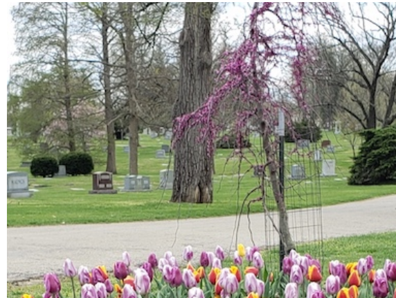
Oakhill - Cincinnati