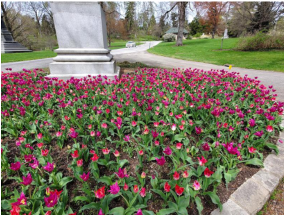
Spring Grove - Cincinnati