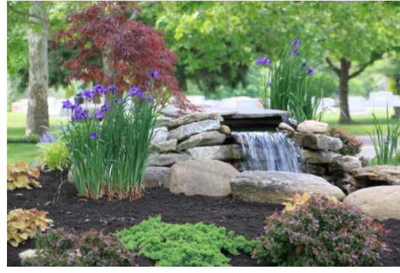
Dayton Memorial Park - Vandalia