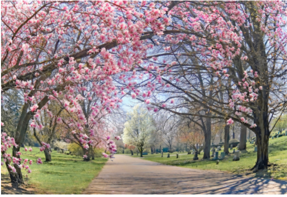
Ferncliff - Springfield