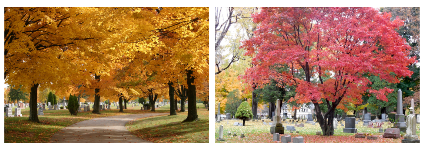
Dayton Memorial Park - Dayton