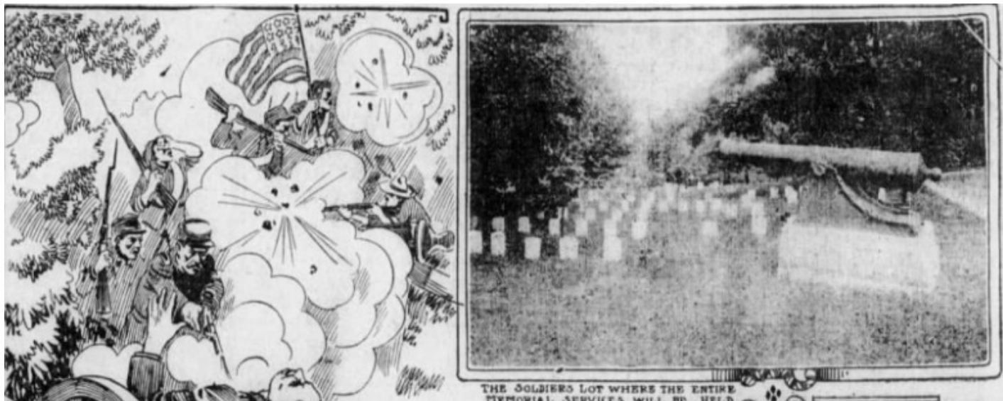
Above: Woodland's Civil War Lot.

Veterans Day is observed annually in the United States on November 11th. Originally (and in some places still) known as 'Armistice Day', the holiday was established in 1919 to commemorate the date when the Armistice with Germany went into effect; signaling the end of World War I. At the urging of WWII veteran Raymond Weeks (of Birmingham, Alabama) and a coalition of veterans' organizations, the holiday was expanded to celebrate all veterans, not just the casualties of WWI, in 1954.