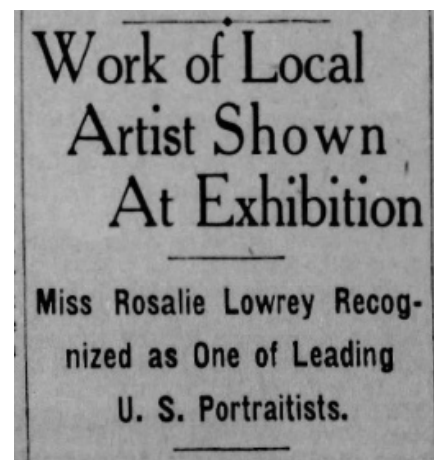
Above: Front page headline; The Dayton Herald , 1/9/1934.

Later it undertook the sponsorship of a class which grew into the old art school at the corner of Monument and St. Clair, and which ultimately became the Dayton Art Institute."