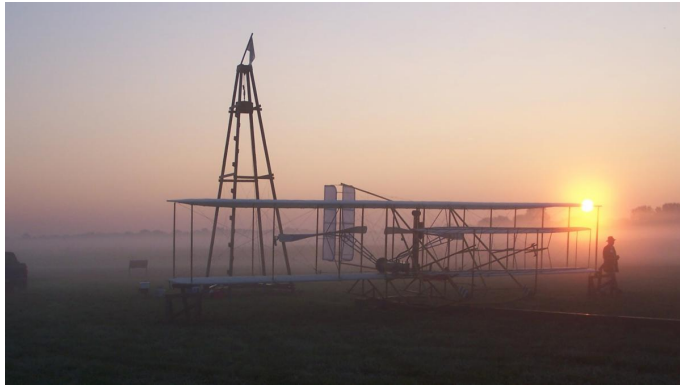
Huffman Prairie Flying Field