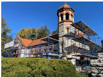
The Chapel is prepared for major stone work repair and restoration.