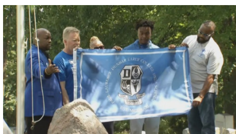
Paul Laurence Dunbar "Fly your Flag" event.