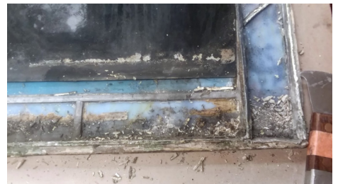
Restoration work on the signature Tiffany window.