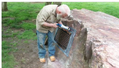
A plaque is attached to Erma Bombeck's stone.