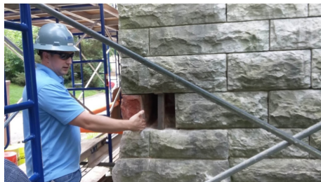
Exterior stone work evaluation.