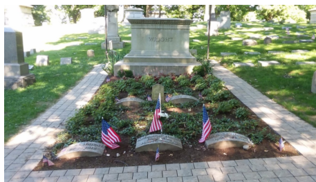
The Wright Brothers grave site gets an upgrade.