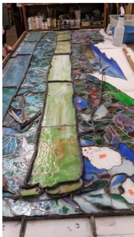
Final restoration of the signature Tiffany window.