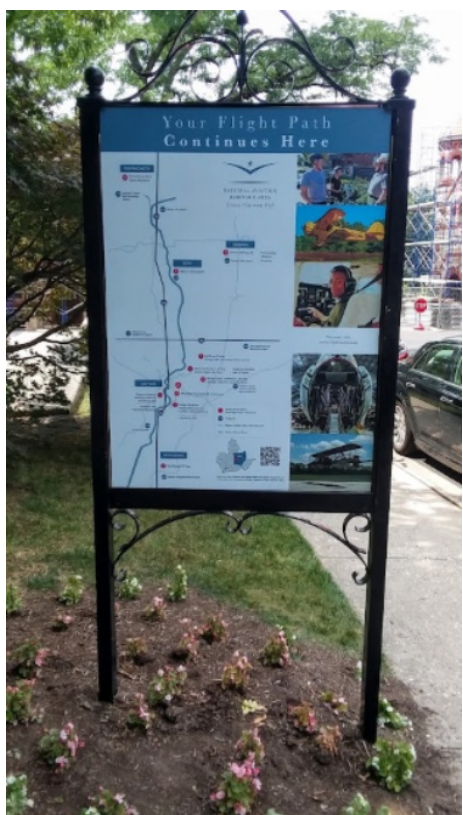
The new National Aviation Heritage Area signage.