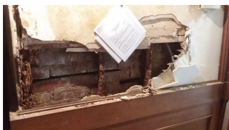
Chapel interior wall evaluation.