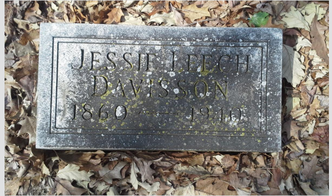
Jesse Leech Davisson died June 29, 1940 at the age of 80. She is buried in Section 113 Lot 17.

As Spring comes upon us, you can take your own walking tour at the cemetery or a virtual tour from the comfort of your couch by visiting our website at: woodlandcemetery.org/tours .