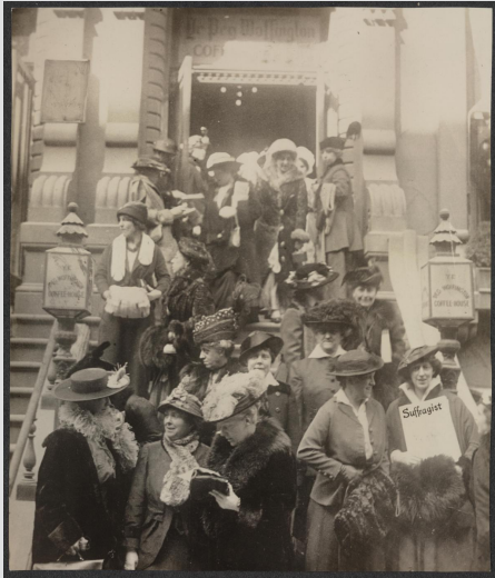
Photograph of Congressional Union for Woman Suffrage Advisory Council leaving the Peg Woffington Coffee House in New York City, March 1915.