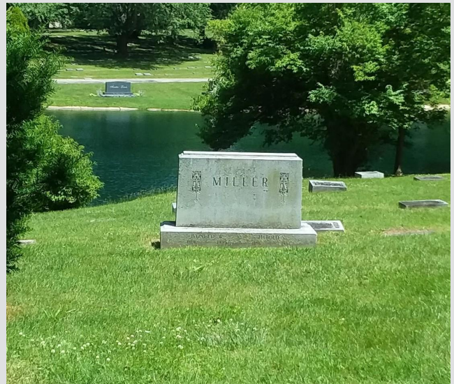
Ivonette (Wright) and Harold Miller

As Spring comes upon us, you can take your own walking tour at the cemetery or a virtual tour from the comfort of your couch by visiting our website at: woodlandcemetery.org/tours .