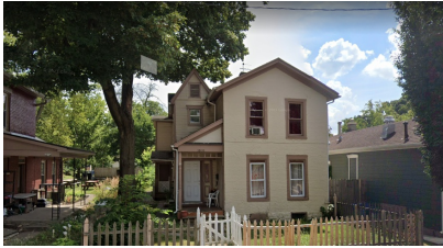
1608 East Fifth Street Home of the Burton and Rice Family's