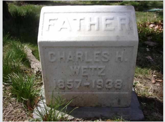
Charles H. Wetz AFTER

As Spring comes upon us, you can take your own walking tour at the cemetery or a virtual tour from the comfort of your couch by visiting our website at: woodlandcemetery.org/tours .