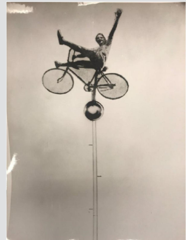
Buckeye Dixie pole sits on a bicycle