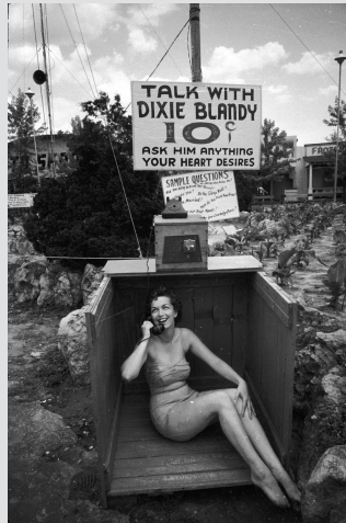
A young lady talks to Dixie on the telephone in 1955