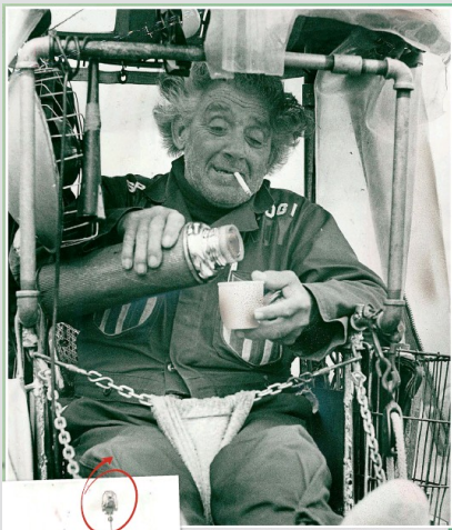
125 days straight at Grona Lund Amusement Park in Stockholm, Sweden