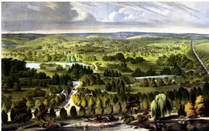
Spring Grove Cemetery 1858

Since its founding over 175 years ago, Spring Grove has remained a leader in cemetery design and management. The landscape "lawn plan" concept was created here. Although it was considered a radical concept of cemetery design at that time, it later became accepted almost universally as the model plan. Spring Grove remains a masterwork of the landscaping art, studied by horticulturists and admired by thousands of visitors. The Cincinnati Chamber of Commerce