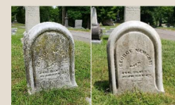
Before and after cleaning of headstone of George Newcom who rests peacefully at Woodland Cemetery and Arboretum.