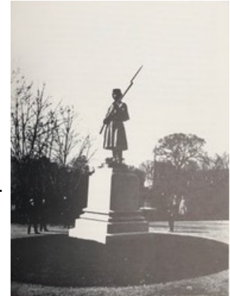
Civil War Soldier

Established as a non-profit cemetery in 1845, Spring Grove has served the community with dignity and respect for over seven generations and is a trusted part of Cincinnati's history. Our city's rich tradition and history is beautifully preserved among acres of towering trees, soothing lakes, and winding roadways. Cincinnati families from all walks of life including such notables as Taft, Kroger, Procter, and Gamble have entrusted Spring Grove to preserve their unique family history.