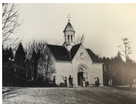
White Pine Chapel