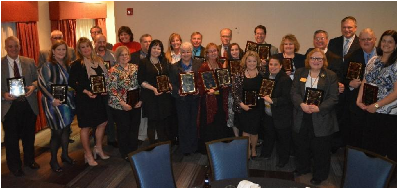
2017 OCA Awards Night