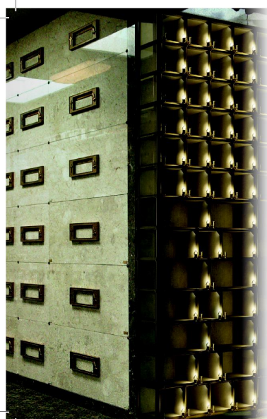
Glass Fronted Niches & EZ Safety Plaques Patented in USA, CANADA and other Countries Specialty Services from Biondan North America